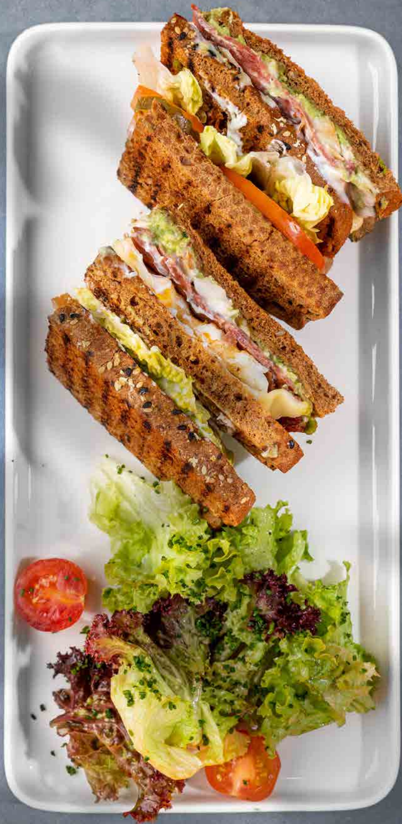
HW CHICKEN SANDWICH