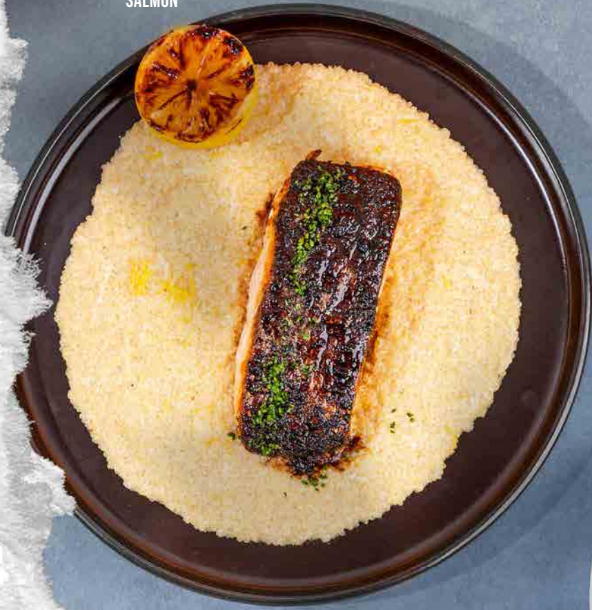
BAKED BALSAMIC SALMON