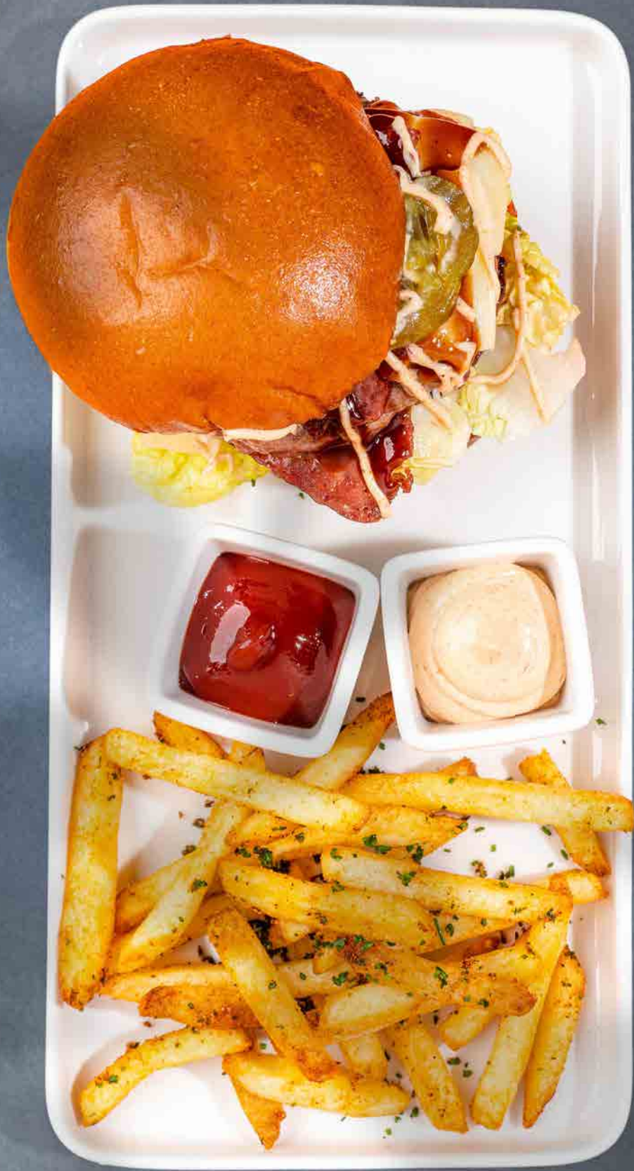
DOUBLE BEEF BURGER